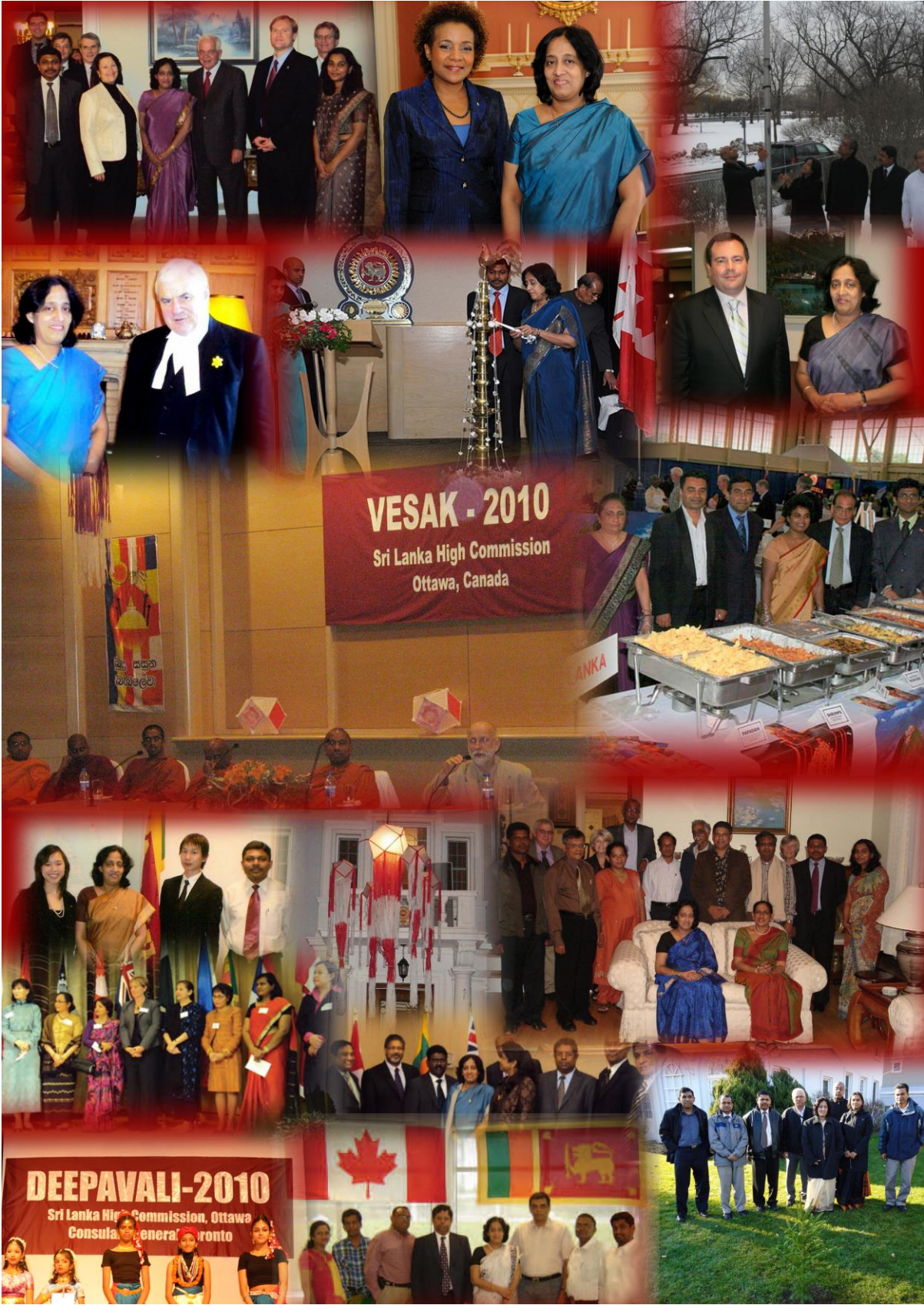
Sri Lanka High Commission, Ottawa, Canada. News & Views – December