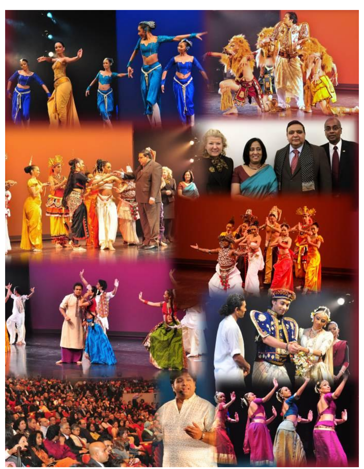
Sri Lanka High Commission, Ottawa, Canada. News & Views – February