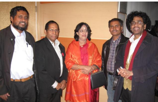
Sri Lanka High Commission, Ottawa, Canada. News & Views – November

While touching briefly on the current developments in Sri Lanka, especially in the North and East, she requested all the Sri Lankans living in Canada to unite and work together for continued peace and prosperity of their motherland. The official ceremony was followed by cultural performances depicting religious and Tamil traditions performed by Tamil and Sinhala artists.